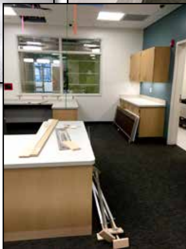
The administration area is nearing completion at Evergreen Elementary School.