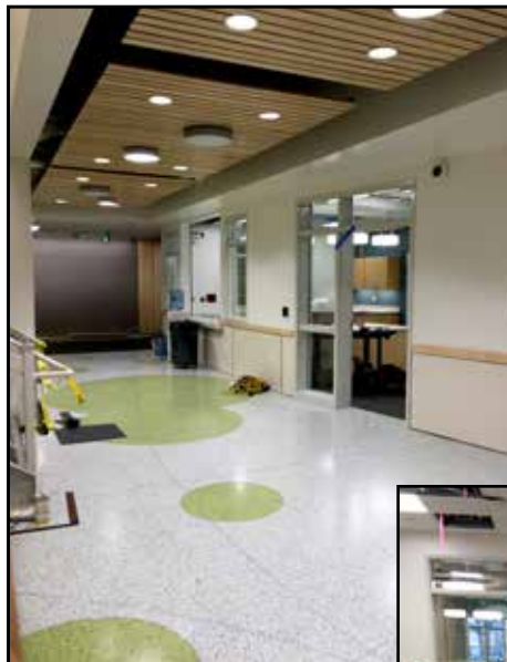
A view of the entrance to the administration office at Evergreen Elementary School.